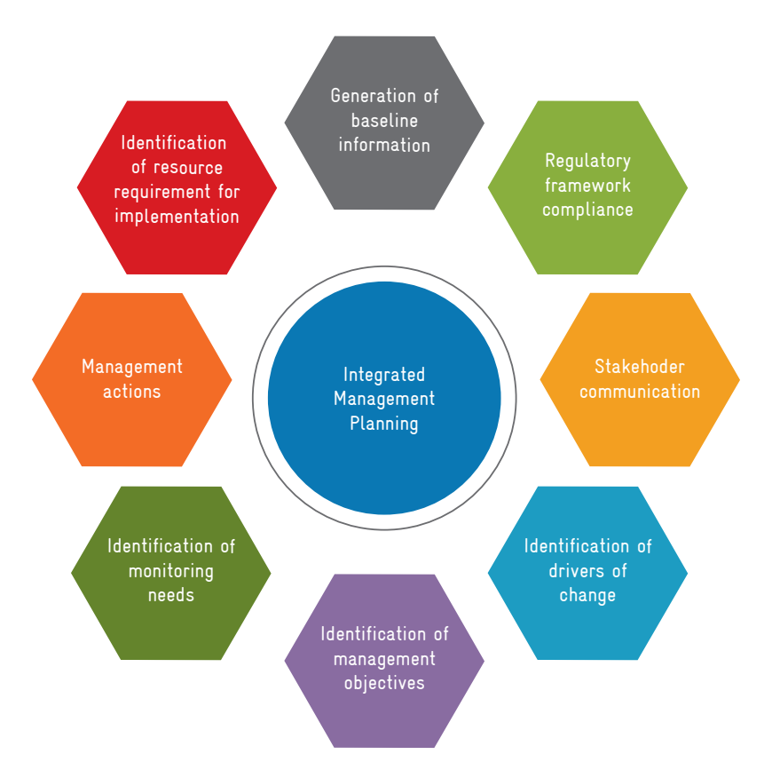
Figure 1: Components of integrated wetland management planning (Adapted from NPCA guidelines, 2019)

As a step towards streamlining the WIAMS framework in the context of Indian wetlands, an expert consultation was organised in New Delhi on