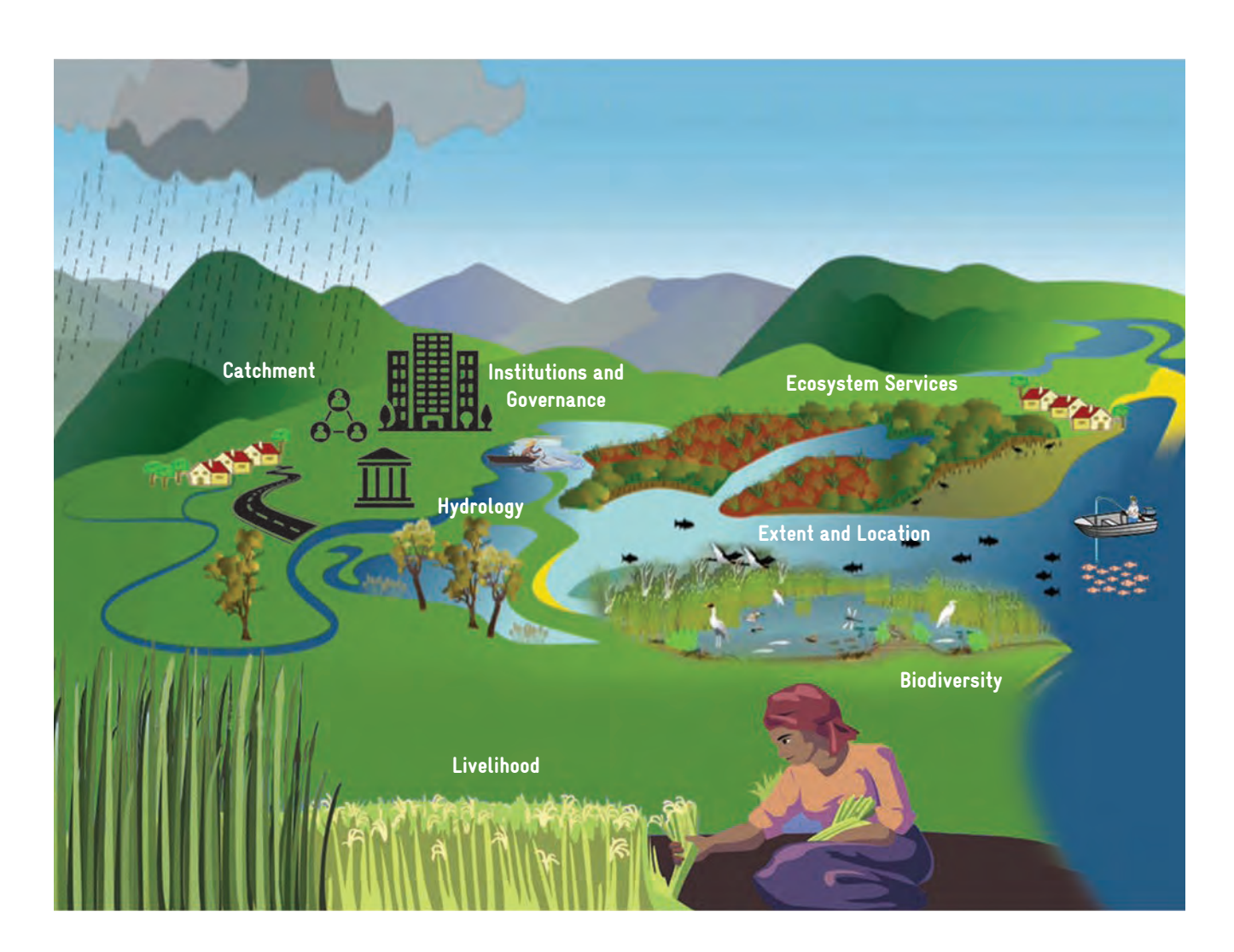
Figure 4: Illustration showing wetland features - (i) Location and extent, (ii) Catchment and hydrology, (iii) Biodiversity, (iv) Ecosystem services and livelihood, (v) Institutions and governance